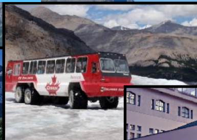
The Sutton Place