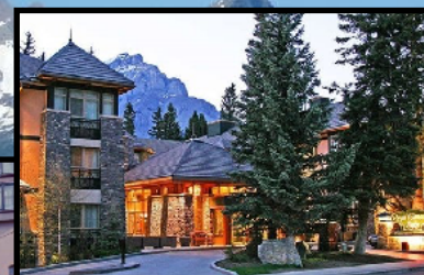
Royal Canadian Lodge

Your journey will begin with a visit to the fabulous west coast cities of Vancouver and Victoria , then journey through the Rocky Mountains of Alberta on the world's most spectacular rail journey, the “Rocky Mountaineer” , which delivers it's passengers to the doorstep of the Icefield Parkway , the Athabasca Icefields and Jasper and Banff National Parks .