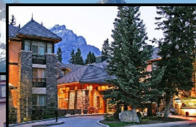
Royal Canadian Lodge

Your journey will begin with a visit to the fabulous west coast cities of Vancouver and Victoria , then journey through the Rocky Mountains of Alberta on the world's most spectacular rail journey, the “Rocky Mountaineer” , which delivers it's passengers to the doorstep of the Icefield Parkway , the Athabasca Icefields and Jasper and Banff National Parks .